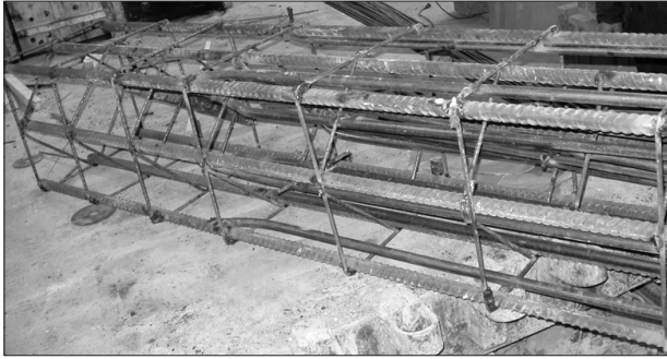
Fig. 1. General view of reinforcement frame of column sample

In addition, additional samples (cubes, prisms, fragments of reinforcing wires) were made, and their tests enabled obtaining data on the physical and mechanical properties of the materials used.